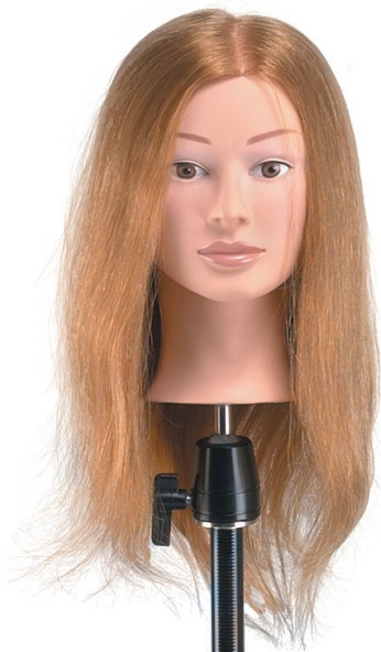
DANNYCO Deluxe Mannequin w/Blonde Hair – 927 BDC