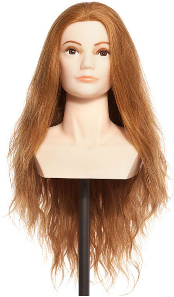
Pivot Point Mannequin Natalia MSMZDZCT-LW